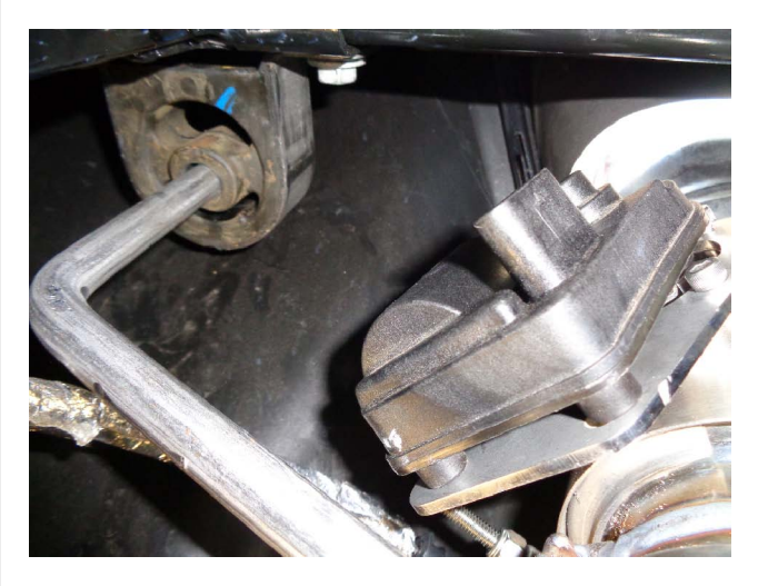
Step 6. If your vehicle has valves, re-connect the wiring harness plugs to the Valve motors and wire mounting bracket. If not yet purchased, Valve Kit is part# 10805