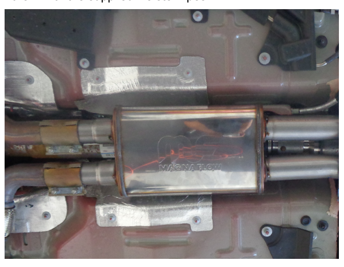
Step 3. Begin installation of the new system by loosely attaching the Resonator Assembly to the outlets using the OEM clamps. Leave all clamps loose until final adjustment.