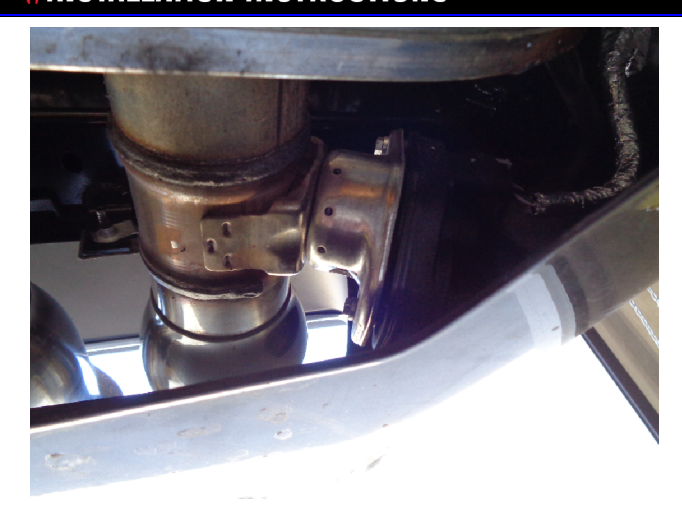
Step 1. To begin, determine if your vehicle has OE exhaust valves, if so, you will need to unplug the electrical connection on the Exhaust Valve Control Motors (Qty 2) located on the OEM exhaust assembly.