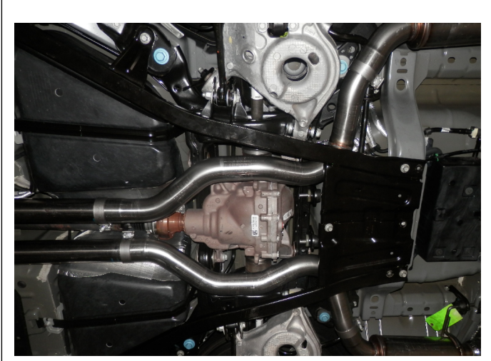
Step 4. Next attach the Mid Pipe Assemblies to the Resonator Assembly using the supplied 3.00" clamps and fitting the hangers into the rubber insulators.

MAGNAFLOW: 1901 Corporate Centre Dr - Oceanside, CA 92056 | 1(800)990-0905 Technical Support: 1(800) 959-9226 | Email: moreinfo@magnaflow.com