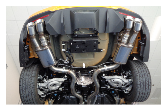
Step 5. Finish the initial installation by fitting the Muffler Assemblies onto the Mid pipe Assemblies using the supplied 3.00" clamps and inserting the hangers into the rubber insulators.